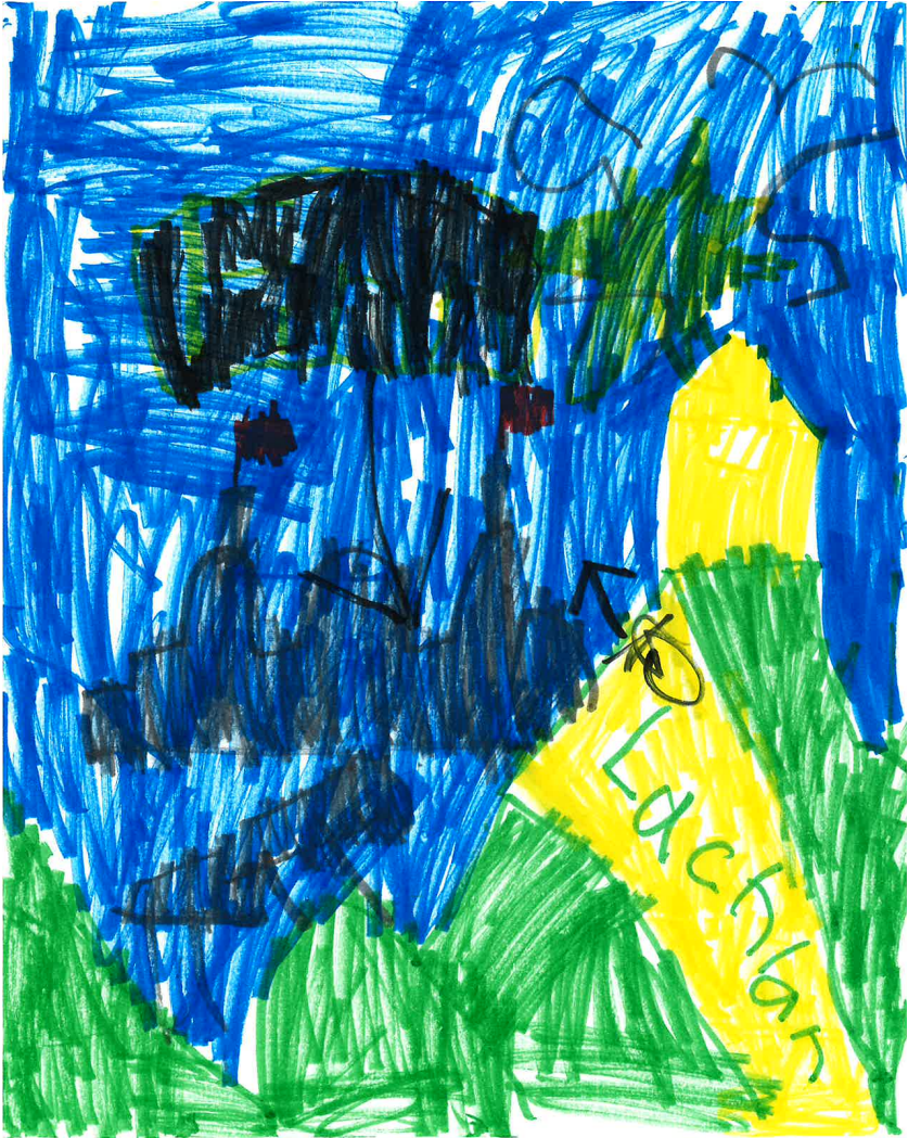
Lachlan Campbell, 6 years old